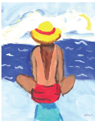
Signed 11x14 Poster $19.95 [$4.95 s/h]