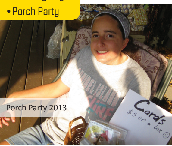
Porch Party 2013

The AMF strives to impact the quality of life in communities with limited resources.